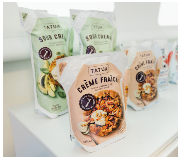
Tatua / Cream, Sour cream, Creme Fraiche, Mascarpone / New Zealand / Ecolan® Air Aseptic 500ml & 1000ml

EXPERIENCE YOUR PACKAGE DESIGN - TRY OUR 3D DESIGN TOOL