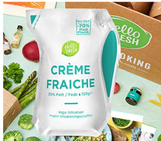
HelloFresh / Sour cream, Creme Fraiche / Germany, United Kingdom, Austria, Sweden, Denmark / Ecolan® Air 200ml