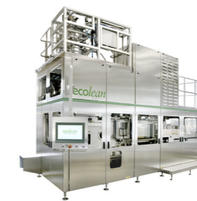
EL4+ Designed for aseptic filling of high and low-acid liquid food products into Ecolean® Air Aseptic portion-sized packages. Capacity: Up to 12,000 packages/hour.