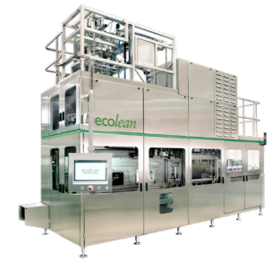
EL6 Designed for aseptic filling of high and low-acid liquid food products into Ecolean® Air Aseptic portion-sized packages. Capacity: Up to 18,000 packages/hour.