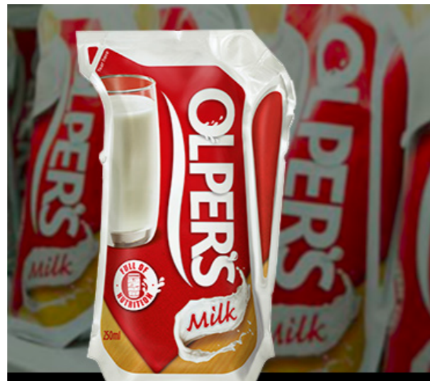
FrieslandCampina Engro Foods / UHT-Milk / Pakistan / Ecolan® Air Aseptic 250ml & 1000ml