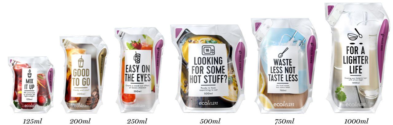
Ecolean® Air Aseptic portion-sized packages (125ml, 200ml and 250ml) are available with straws. The family-sized packages (500ml, 750ml and 1000ml) come with an option for the reclosing device SnapQuick™.

Ecolean® Air Aseptic for ambient distribution brings healthy, flavourful and exciting food to people all over the world. With its unique, eye-catching format it is perfect for displaying products such as white milk, flavoured milk, drinking yoghurt, juice drink, nectar, cafe latte and ice tea.