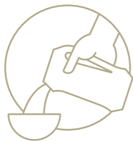
Pour using the air-filled handle.