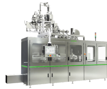
EL2+ Automatic filling with five filling stations for filling liquid food products into Ecolean® Air portion-sized packages. Capacity: Up to 12,000 packages/hour.