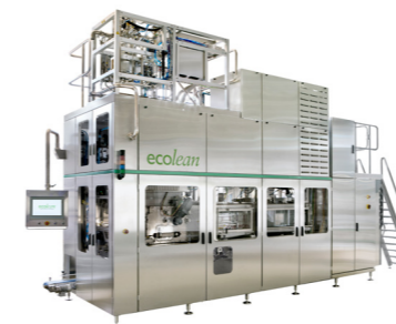
EL3+ Designed for aseptic filling of high and low-acid liquid food products into Ecolean® Air Aseptic family-sized packages. Capacity: Up to 7,500 packages/hour.