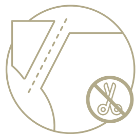
Easy to open.

All of Ecolean packages have been approved by the Swedish Rheumatism Association as easy to use and pour from. We are very proud of this recognition! Everyone, no matter age or hand strength should be able to use any package, don't you think?