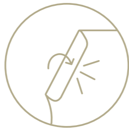
Reclose with SnapQuick™.