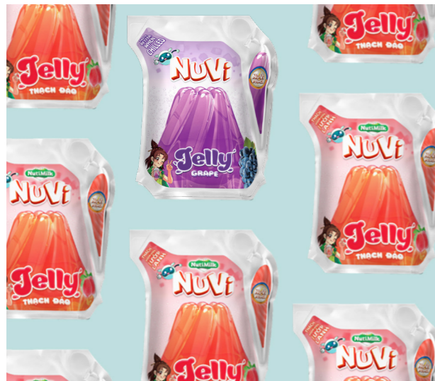
Nutifood / Jelly / Vietnam / Ecolan® Air Aseptic 125ml