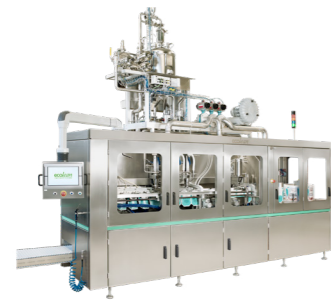
EL1+ Automatic filling with four filling stations for filling liquid food products into Ecolean® Air family-sized packages. Capacity: Up to 7,000 packages/hour.