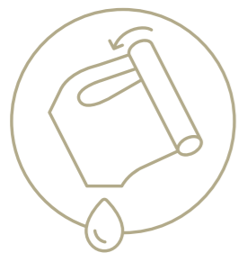
Easy to empty completely.