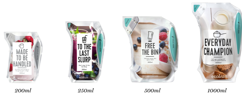
The small Ecolean® Air packages (200ml and 250ml) are available with or without straw. 500ml and 1000ml come with an option for the reclosing device SnapQuick™.

Ecolean® Air masters chilled distribution to perfection. We offer a complete system for products that need to be distributed and stored chilled. Milk, yoghurt, cream, kefir, sour cream, soy drink and different still beverages have all seen the inside of an Ecolean® Air package.