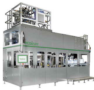
EL4 Filling machine