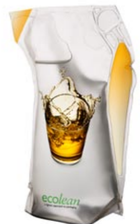
ECOLEAN® CLEAR 250