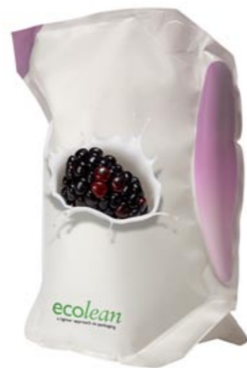
ECOLEAN® AIR 500