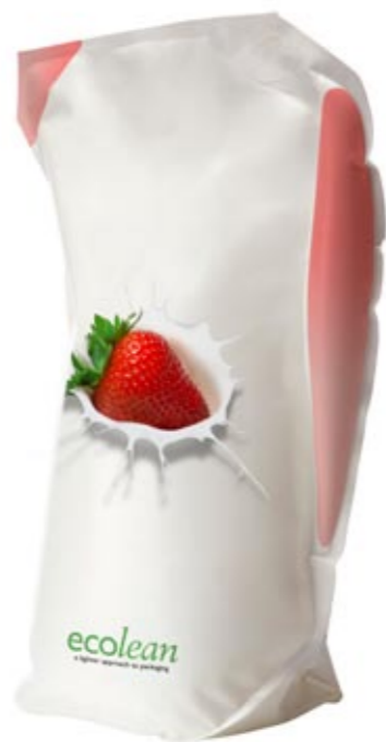
ECOLEAN® AIR 1000