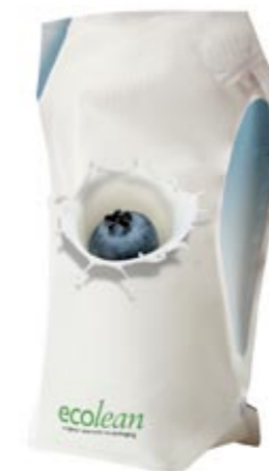
ECOLEAN® AIR 200