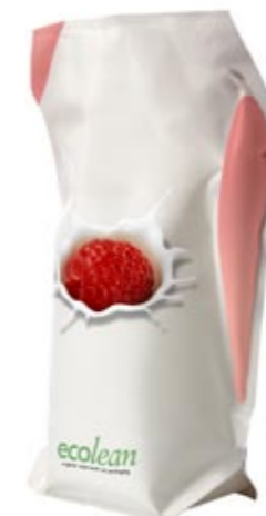
ECOLEAN® AIR 250