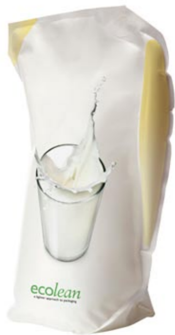
ECOLEAN® AIR ASEPTIC 1000

Read more about using less at www.ecolean.com