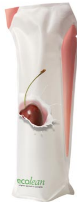
ECOLEAN® AIR 500 S