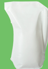
Ecolean® Air Aseptic