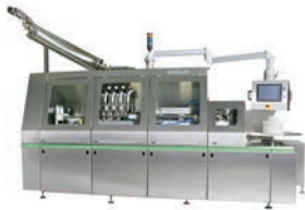
EL2 Filling machine