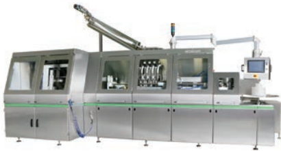
EL2+EP2 Filling machine + packing machine